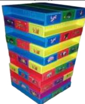
Tabel 1. The Biostacko media prototype consists of several components:

Game blocks, consisting of several colors with images of flora and fauna.